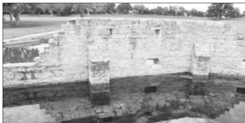
The sulphur water sources in Lampasas made bath houses like this one a popular draw for people from across the country looking to improve their health.