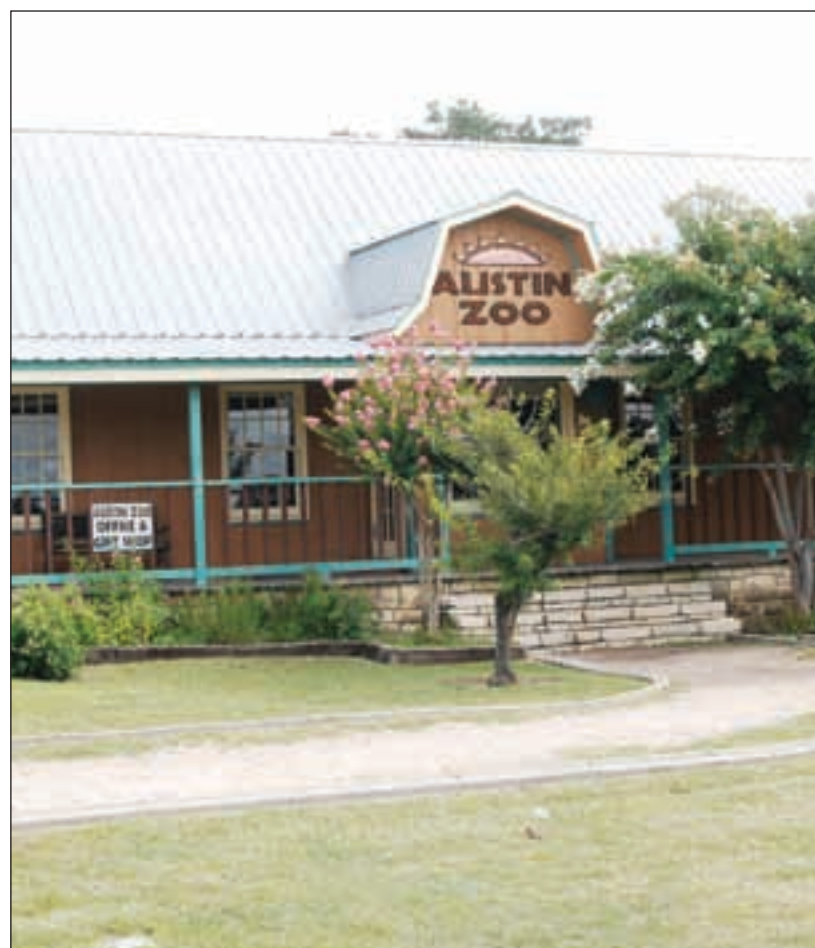
Austin Zoo and Animal Sanctuary was originally a private ranch. The organization now rescues animals, rehabilitates them and displays them in an effort to educate the public.

The zoo has a quiet warmth and charm that I found enjoyable. For families looking for a low-key summer morning with their kids, it's a nearby destination that's also affordable. And for those of us who are animal lovers – what could be better than seeing animals rescued from dire situations, rehabilitated and available to help educate the public? The Austin Zoo and Animal Sanctuary is an exotic oasis that's close to home and sure to delight visitors of any age.