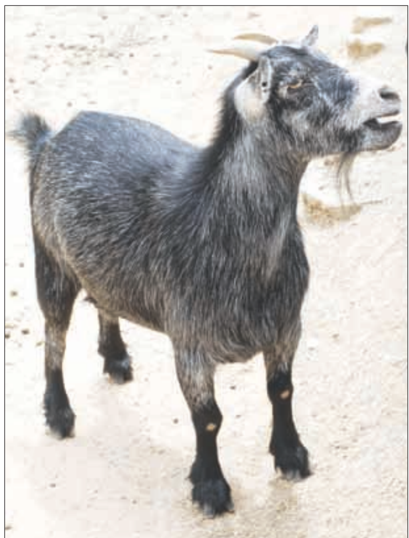
A pygmy goat in the petting corral heads to the fence to get some treats from zoo visitors.